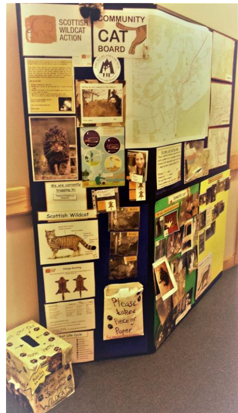
Fig. 1. Community cat board in Strathpeffer.

kittens; a swathe of news articles based on an NTS press release about a possibly wildcat we found that had been captured and collared in 2013-2014; and articles in Your Cat Magazine , Wildcats Magazine and Scottish Mountaineer . All this activity helped us increase our online profile too and Facebook remains our most used online engagement tool. Our website could be used more so we will be reviewing this to see how we can improve the website. A recent change was to include a series of 'Mogshot' pages to get feedback from the public on whether any cats we had detected on camera were actually pet cats. You can see these pages from here . Vicky has created a visual summary of our comms activity over the past year (Fig. 2), illustrating our keenness to create more visual content in the future, such as infographics like this.